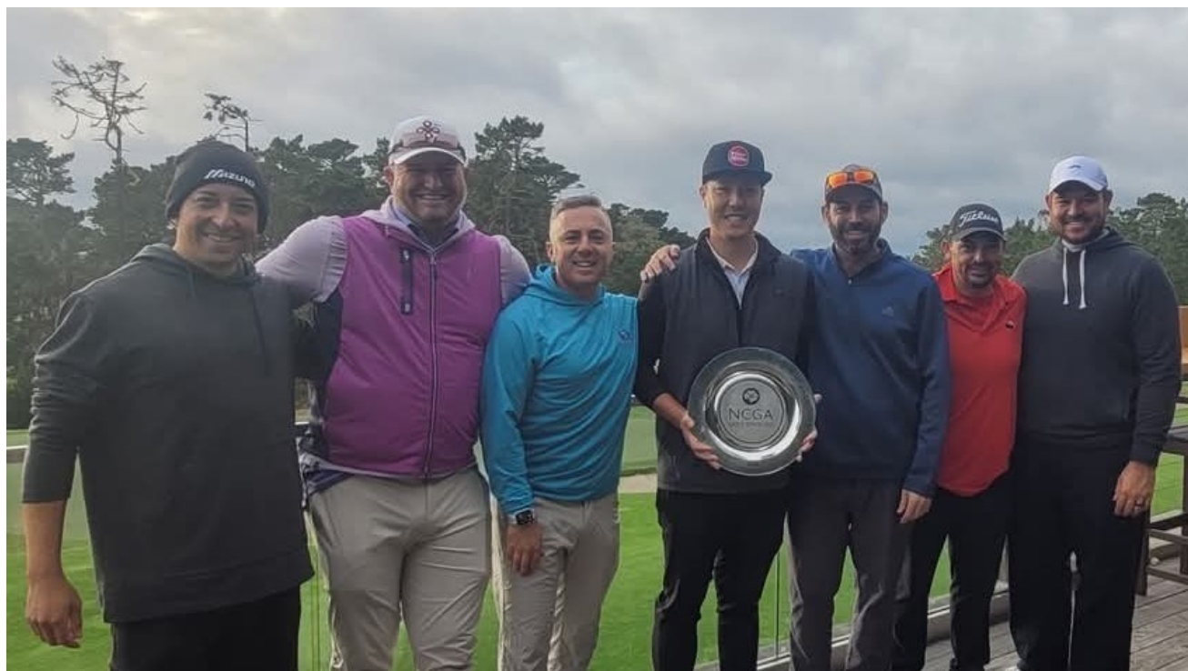
The members of the NCGA NorCal Player's League Championship winning team.