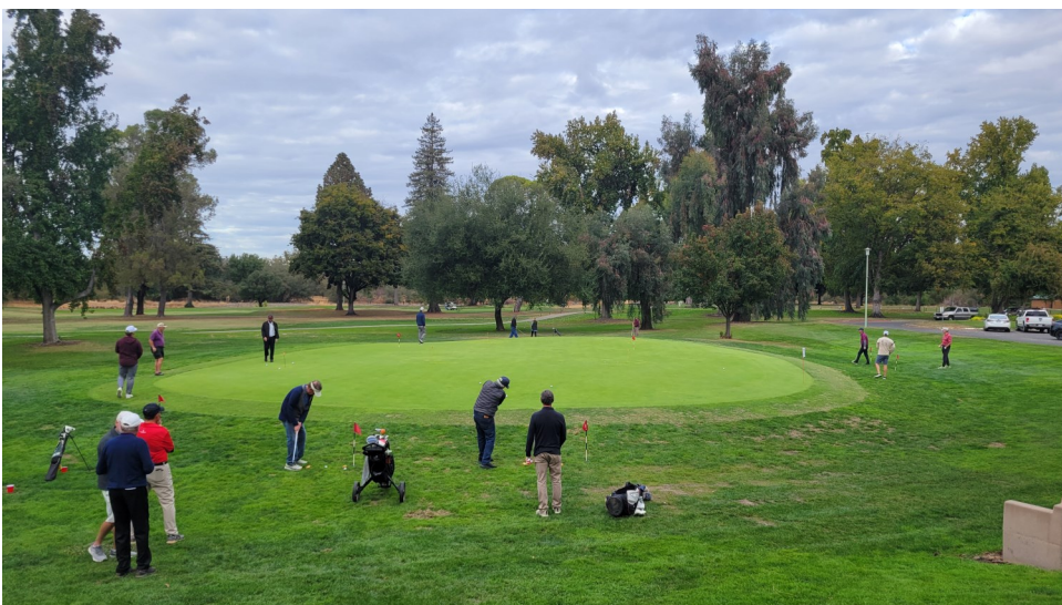
Players brought their skills to this competition. Some more than others!